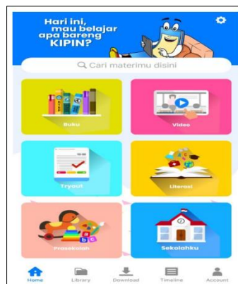
Figure 3. Kipin School 4.0 app via Android

Kipin School 4.0 is equipped with "Download and go" technology which can download thousands of materials just once using the internet and after that it can be used without using the internet. This educational application only needs an internet line and a smartphone or laptop that makes it easier for students without having to bring a lot of books to school. The display for the smartphone version can be seen in figure 3.